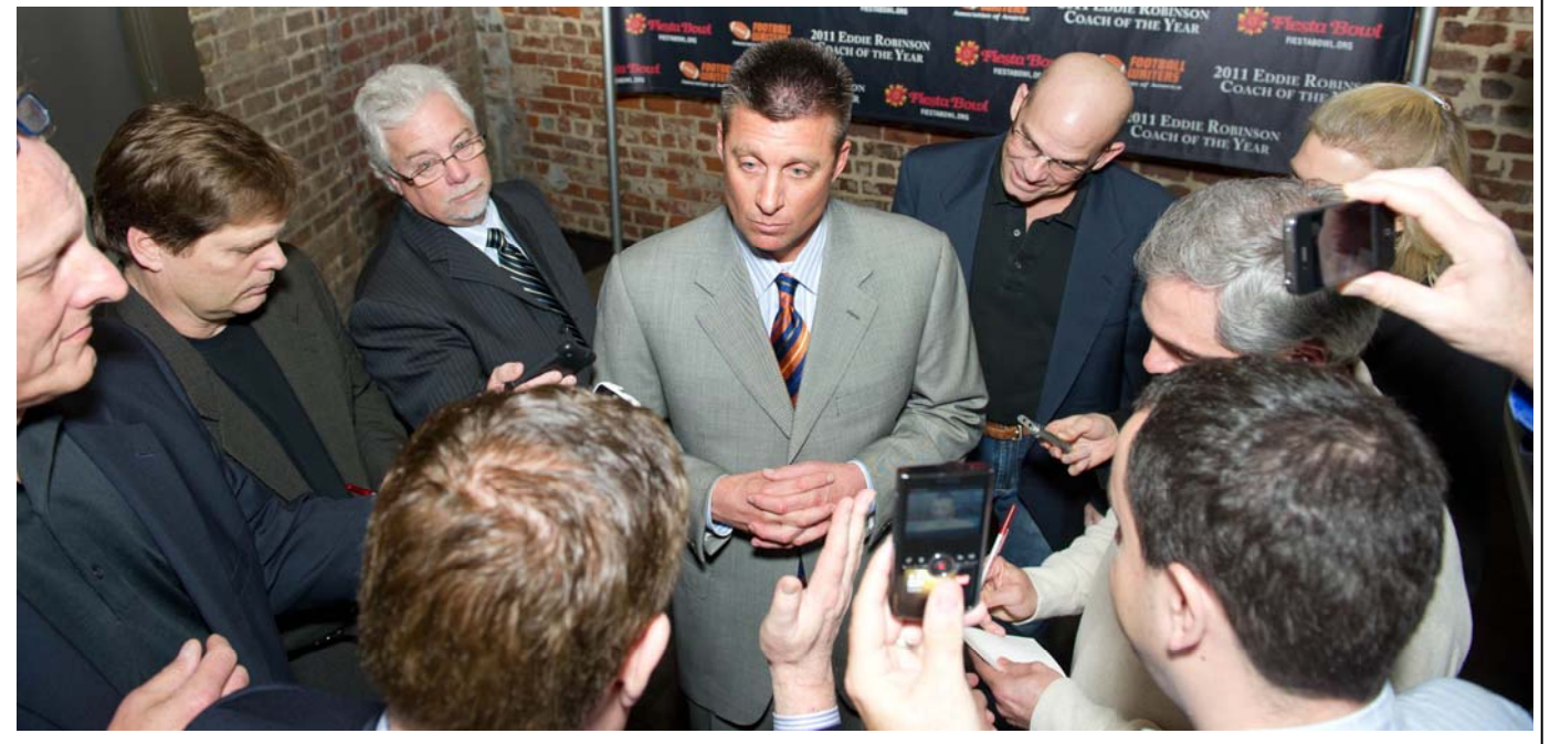
FWAA members huddle around Gundy for a quick Q&A after the award presentation.