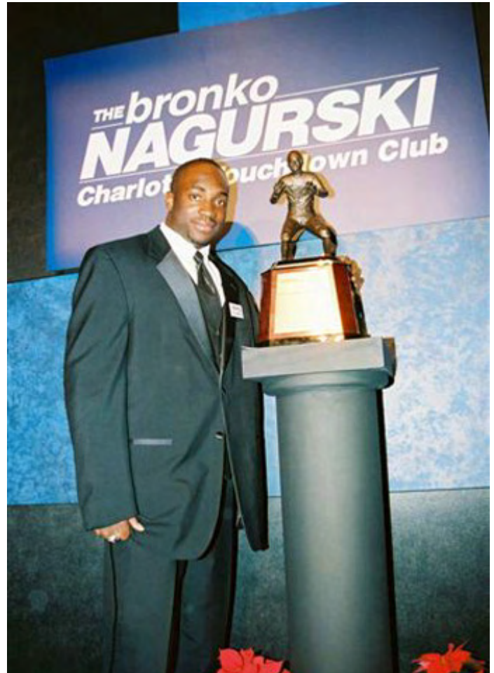
Louisville defensive end Elvis Dumervil won the 2005 Bronko Nagurski Trophy.

The 2006 Nagurski Watch List was developed by the FWAA All-America committee with the help of the schools and conferences. The FWAA merely presents the list as informational. It is by no means final and remains open during and before the season.