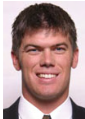
Returning 2006 FWA All-Americans, left to right: Southern California wide receiver Dwayne Jarrett, Notre Dame wide receiver Jeff Samardzija, Miami defensive back Brandon Meriweather and Colorado kicker Mason Crosby.